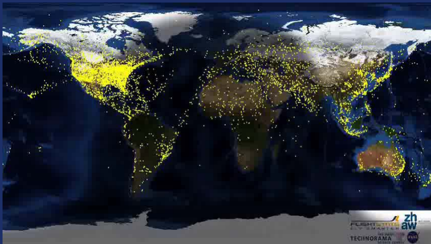
Daily World Aircraft Activity